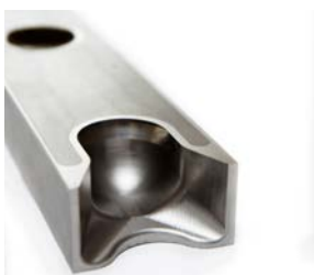
Slide Valve Carrier

Wall Colmonoy supplies precision machined components for the food industry, with particular expertise in Wallex® cobalt-based super-alloys. These parts are widely used for applications such as homogenisation equipment, aseptic packaging and canning.