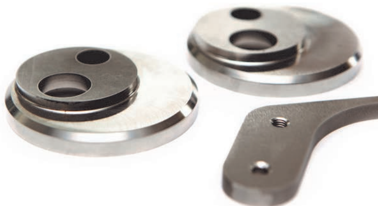
Wallex® 6 Automotive Industry