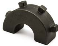
Neck Ring Inserts