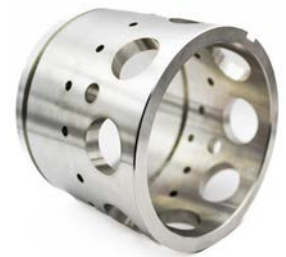
Flow Control Cage Valves