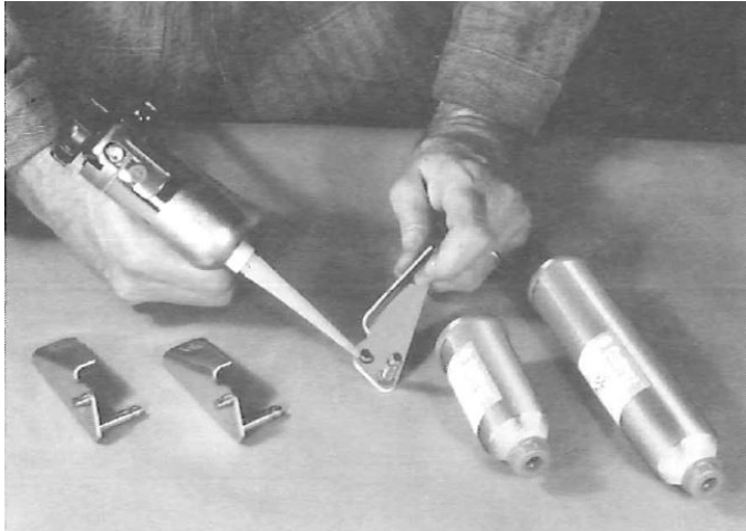
CuBraz Filler metal is powdered copper pre-mixed with a binder. It is easily applied with air-powered applicator, prior to furnace brazing.